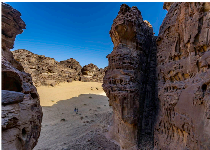
— Creatives explore the AIUla landscape, courtesy Desert X AIUla