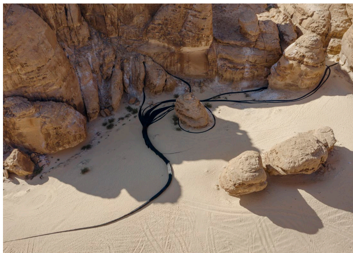
— Muhanad Shono, The Lost Path , installation view at Desert X AIUla 2020, photo Lance Gerber, courtesy the artist, Athr Gallery and Desert X AIUla. Shono is currently part of AIUla pilot artist residency programme, until January 2022