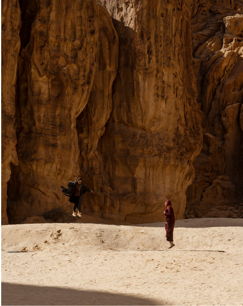
— Visitors jump on Manal AlDowayan's Now You See Me Now You Don't at Desert X AIUla 2020