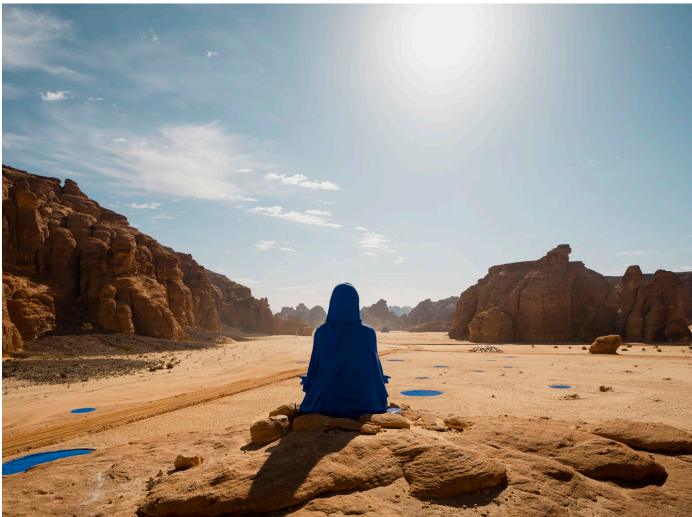
— Lita Albuquerque, NAJMA (She Placed One Thousand Suns On The Transparent Overlays Of Space) , installation view at Desert X AIUla 2020